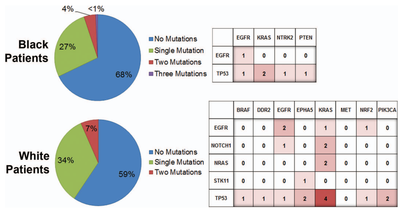
FIGURE 1 . Overall rates of detection and patterns of multimutations by race. The percentages of specimens where a single mutation or multiple mutations were discovered are presented in the pie graphs ( left ). The frequencies for the co-occurrence of mutated genes are displayed in the charts ( right ).

and DDR2 p.G505S in a black patient. Both variants were previously characterized as activating mutations in NSCLC. <sup>15</sup>